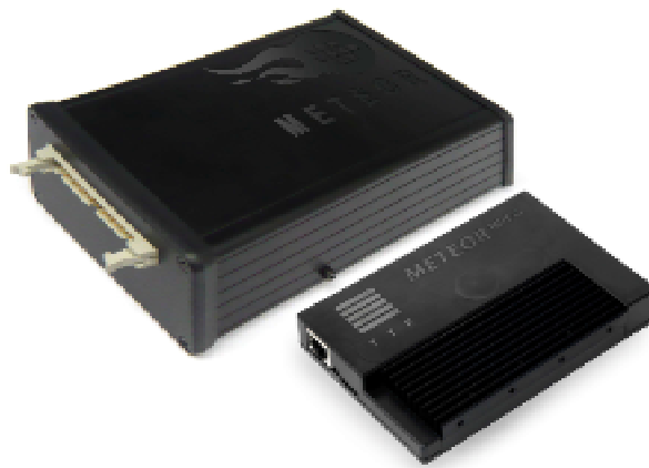
Meteor Drop Tuner and Meteor Head Driver Card